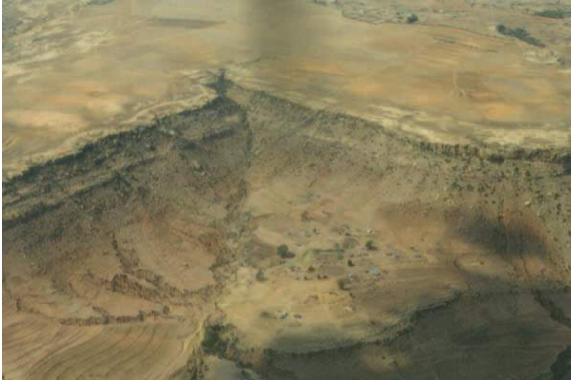
Photograph A for Question 5