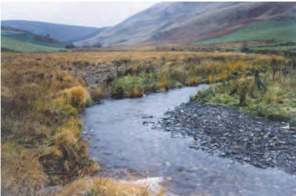
Photograph B for Question 9